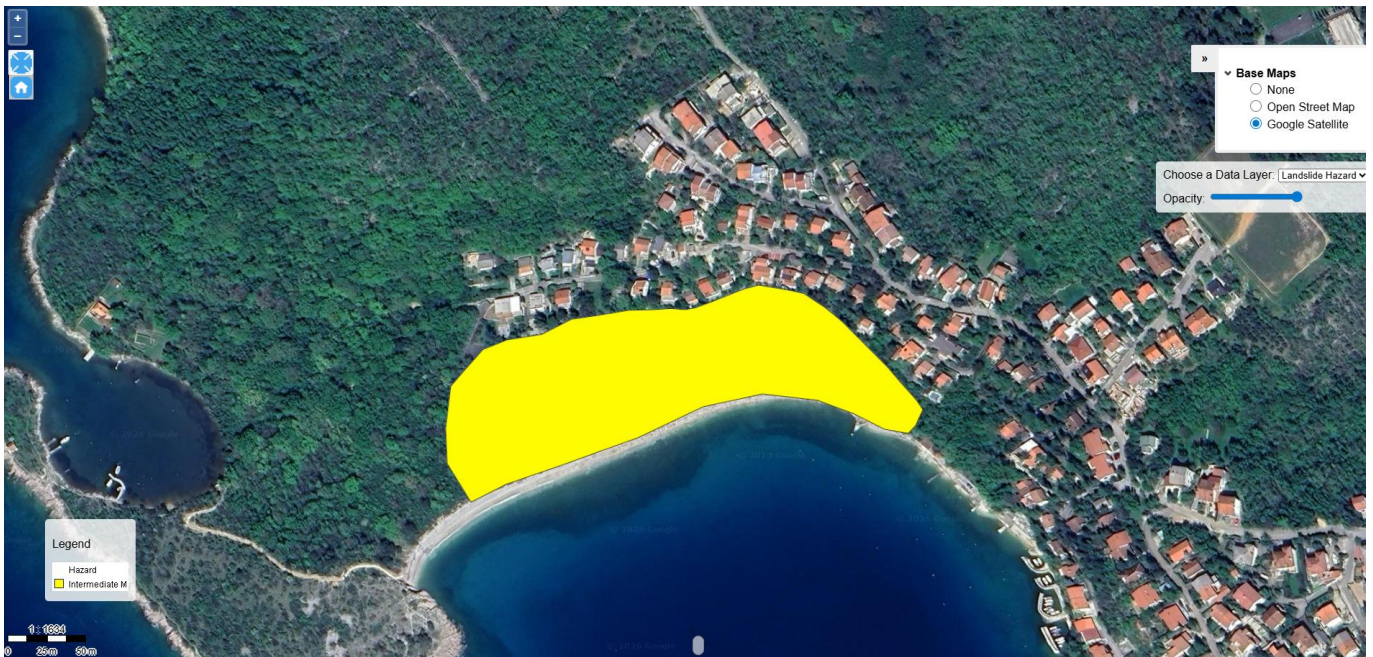
Figure 3. Landslide hazard map of Havisce area