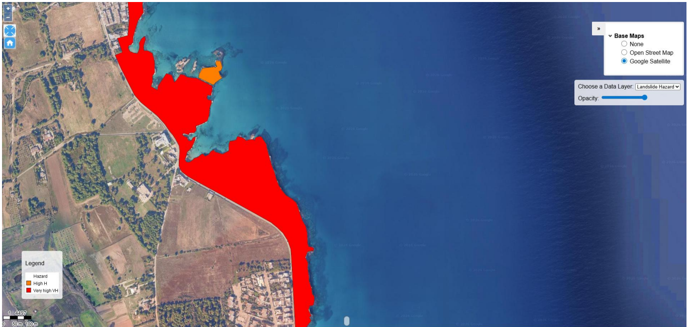
Figure 2. Landslide hazard map of Roca area