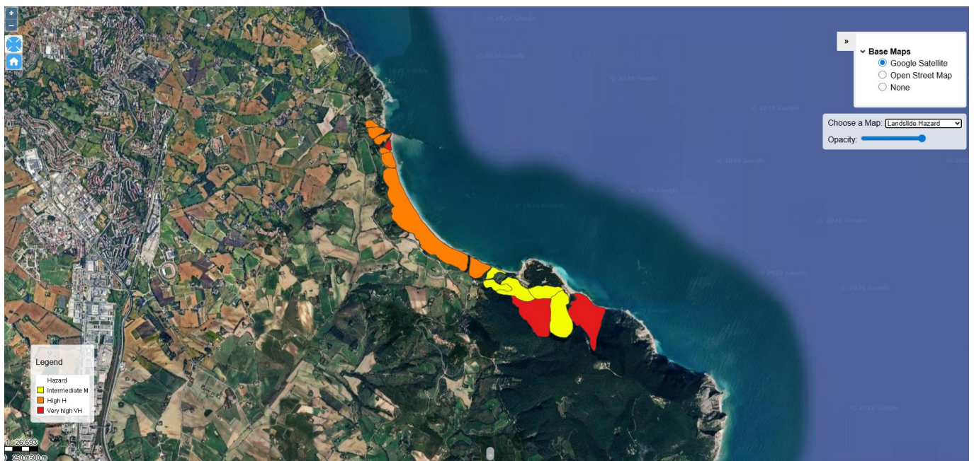
Figure 1. Landslide hazard map of Conero Park