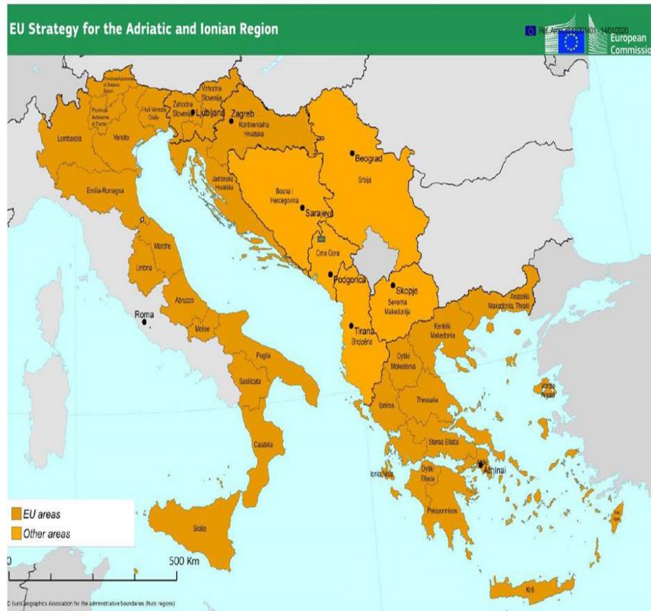
MAP OF THE EU STRATEGY FOR THE ADRIATIC AND IONIAN REGION